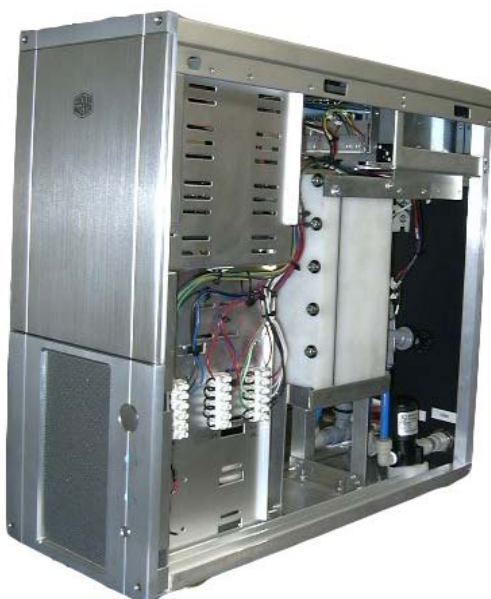
Figure 2. FTC demonstration unit with side panel removed

The FTC is compact and efficient. A demonstration unit with external dimensions of 18 x 8 x 20 inches yields a product, which is over 90% purified, with 60% recovery and an average energy usage 60W (see Figure 2). This was done with Newport Beach tap water, at a flow rate of 0.5 GPM of purified product. The external dimensions of the unit can be further reduced depending on customer requirements. (A note should be made here about performance. The variables with any FTC system include flow rate, purification, source TDS, and recovery. The performance values enumerated above are for a specific design point. These variables can be modified to accommodate a wide range of values. As an example, the TDS level of the input stream can go as high as brackish levels for this unit.) Table 3 shows the power required to purify an input stream to 90% purification using this unit.